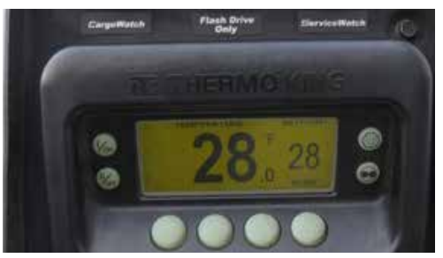
Trailer temperature monitoring equipment

Dramatic drone shots of equipment on road