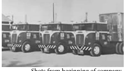
Shots from beginning of company