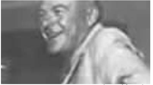
Shot of founder