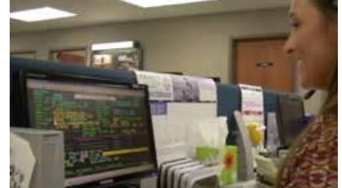
Order information online, on screen