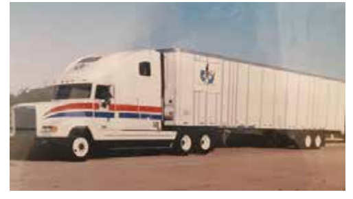
Shots from 80's and/or 90's