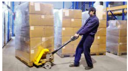
Shipment loaded from delivery

Next, our local or regional fleet is dispatched to your pickup location to secure the order and return to our temperature controlled service center for distribution.