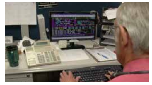
Truck/Driver being dispatched

We're 100% asset based, and that means that every driver on your load is our driver, trained by us.