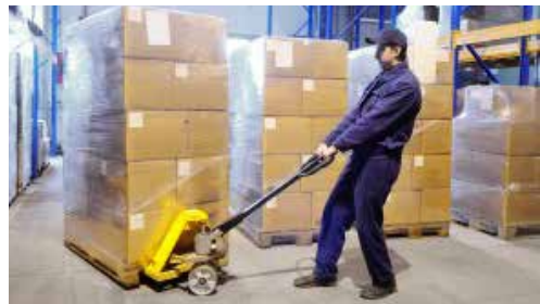
Freezing cargo is loaded