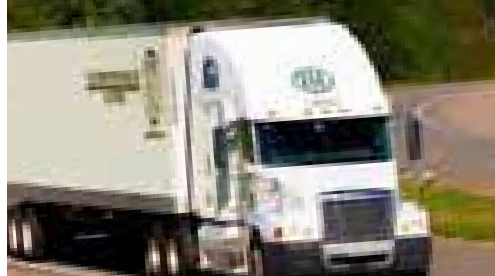
Dramatic drone shots of equipment on road