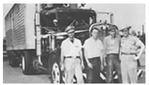
Shot from beginning of company