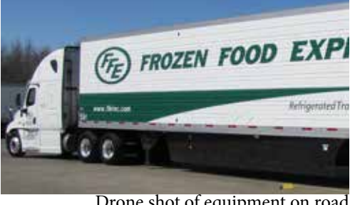
Drone shot of equipment on road