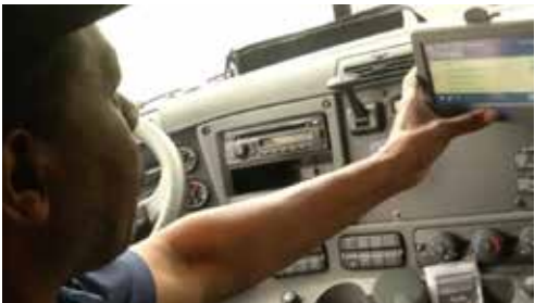
Driver in action with FFE shirt and hat